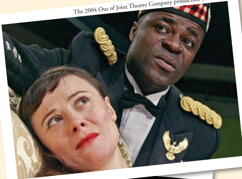
The 2004 Out of Joint Theatre Company production in London