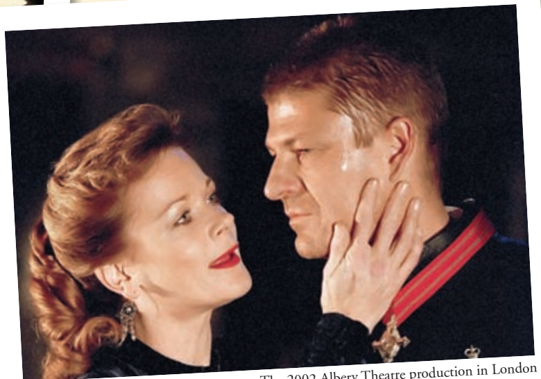
The 2002 Albery Theatre production in London