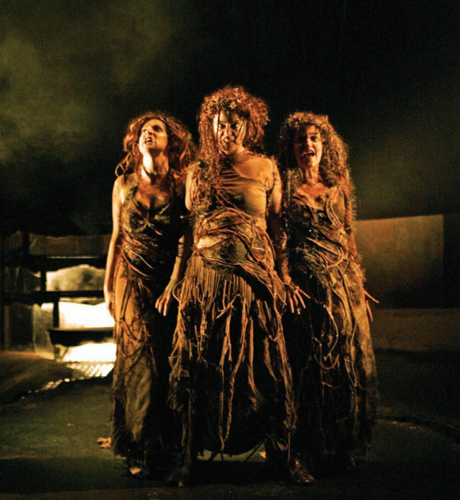
The three witches, from the 2005 Derby Playhouse production of Macbeth