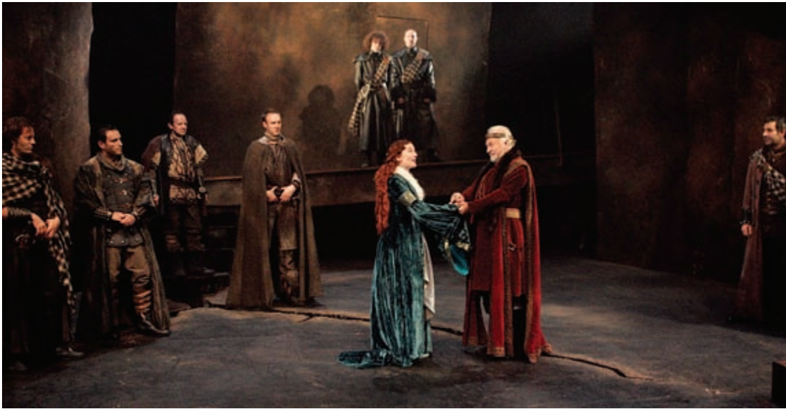
Lady Macbeth greets King Duncan.

Lady Macbeth. Your servants ever Have theirs, themselves, and what is theirs in compt To make their audit at your Highness' pleasure, Still to return your own.