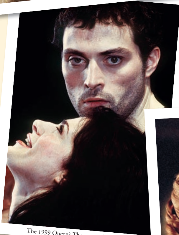
The 1999 Queen's Theatre production in London