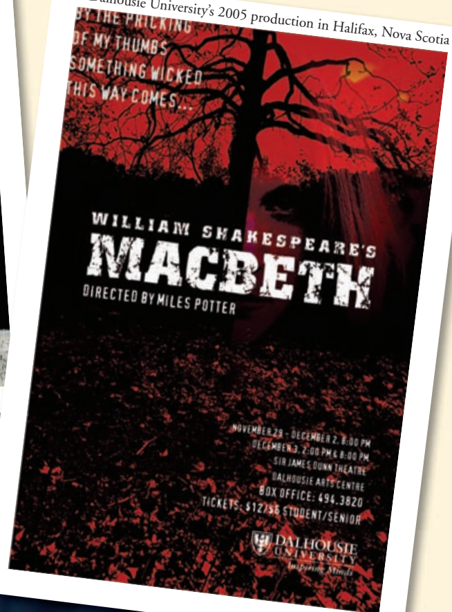
Dalhousie University's 2005 production in Halifax, Nova Scotia

Flyers and posters are among the materials used for promotion , in order to attract an audience for a play. What ideas do each of these posters for Macbeth communicate about the play? Which poster grabs your attention most, and why?