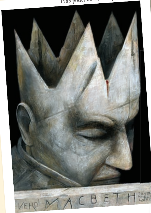
1985 poster for Verdi's opera Macbeth