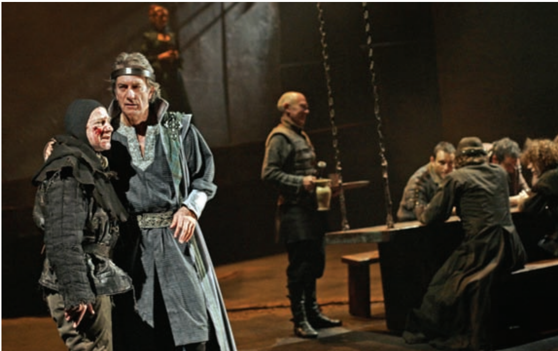
Macbeth and one of the murderers

5 keeps her state: sits on her throne rather than at the banquet table.