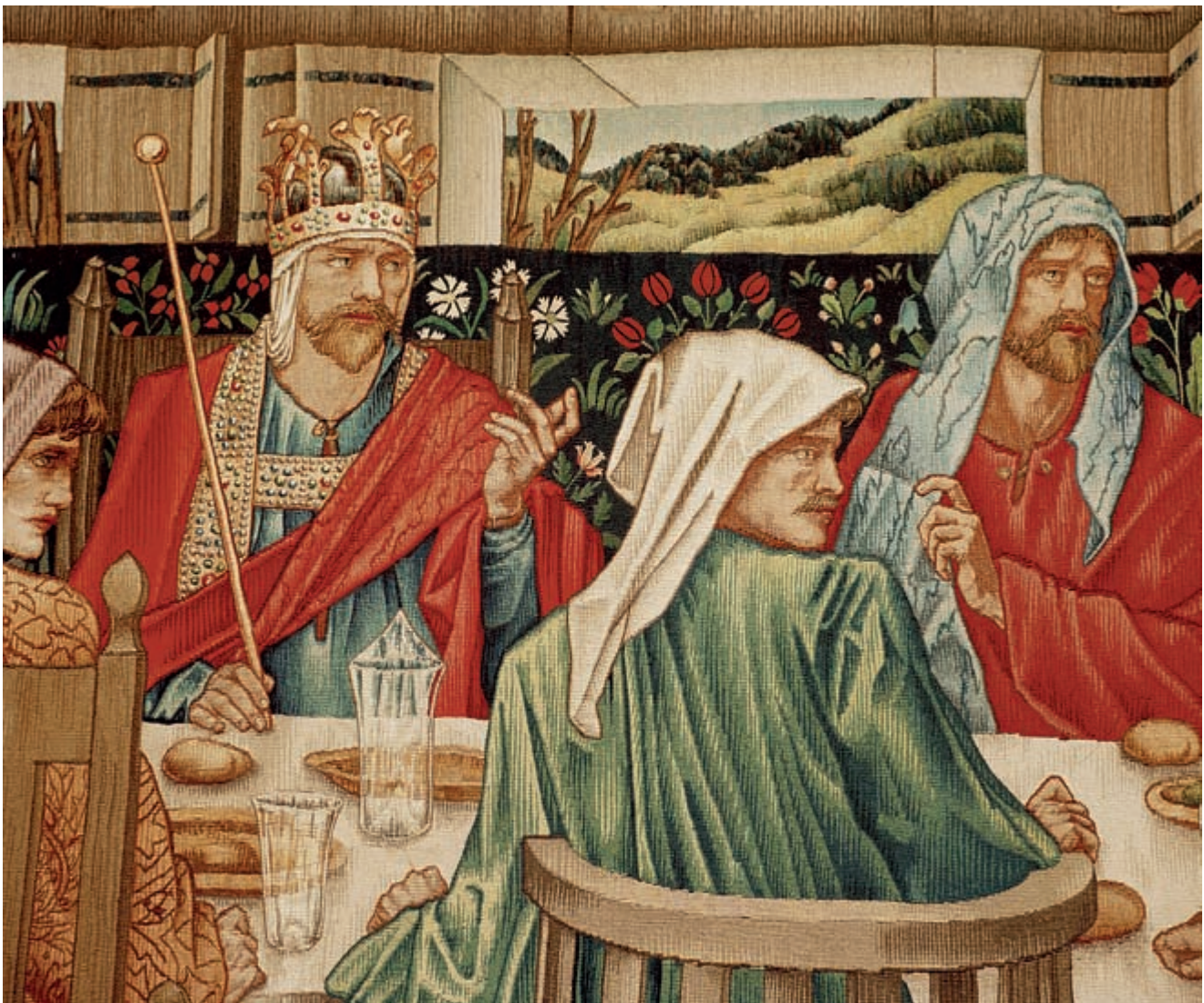
Detail of The Holy Grail Appears to the Knights of the Round Table (1927–1932), by Morris & Company, Merton Abbey Tapestry Works, after design about 1891 by Edward Burne-Jones. 250 cm × 530 cm. Münchner Stadtmuseum, Munich.

25 breastplate or gorget (gôr'jýt) or iron cleats : armor for the chest, the throat, or the shoulders and elbows.