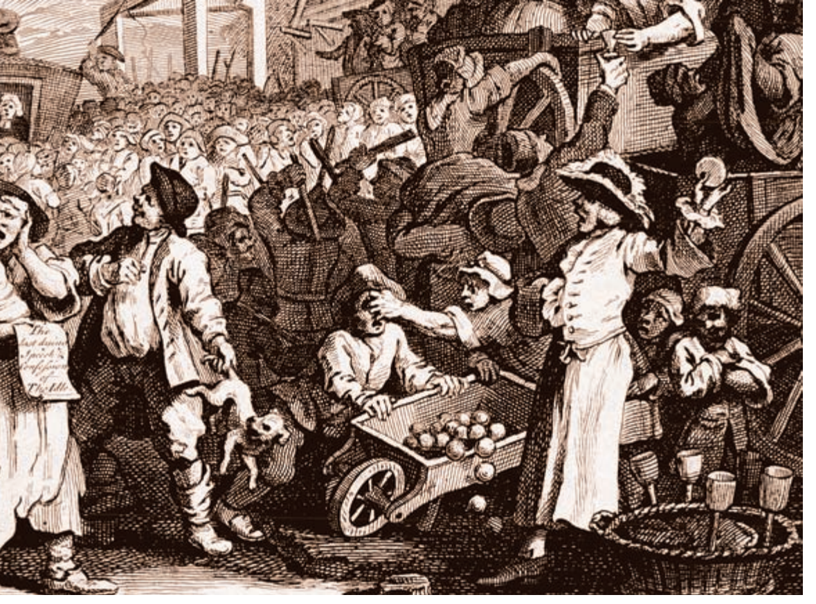
The Idle 'Prentice Executed at Tyburn, William Hogarth. Plate XI of Industry and Idleness, 1833. Engraving.

frequent experience that their flesh was generally tough and lean, like that of our schoolboys, by continual exercise, and their taste disagreeable; and to fatten them would not answer the charge. Then as to the females, it would, I think with humble submission, be a loss to the public, because they soon would become breeders themselves; and besides, it is not improbable that some scrupulous people might be apt to censure such a practice (although indeed very unjustly) as a little bordering upon cruelty; which, I confess, hath always been with me the strongest objection against any project, how well soever intended. [5]